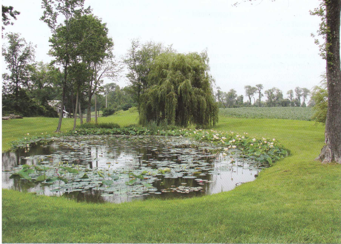
The edges of ponds, even small ones, such as this lily pond, often harbor grass-skipper butterflies such as Least Skipper. July 4, 2006. Ghent, Columbia Co., NY.

or sedges. Hobomok and Zabulon Skippers, for example, apparently like forest edges/shrubs for perching, and we have consistently found Juniper Hairstreaks in areas where Eastern Redcedar is encroaching on farmland. However, we have not found any of the true shrubland butterflies (e.g., those listed by Wagner in his Connecticut work) on farms.