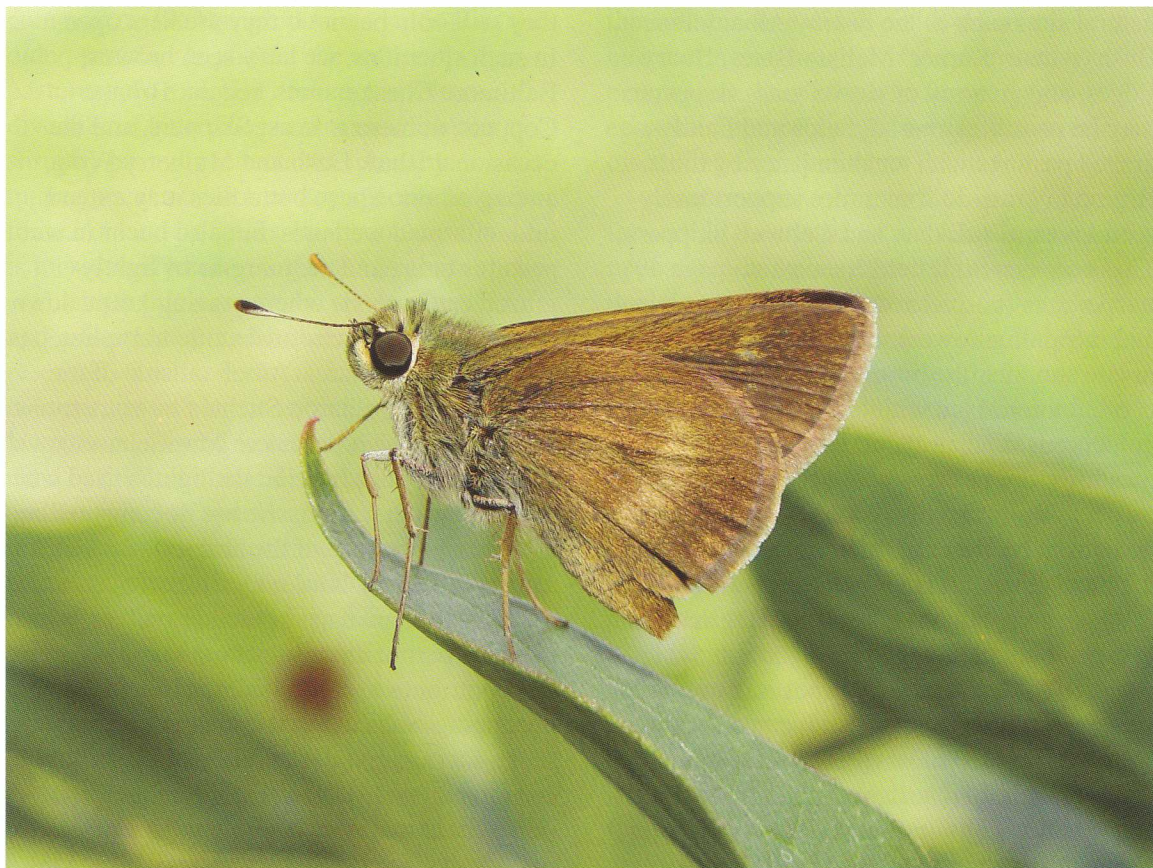
This Northern Broken-Dash was found not far from the lily pond shown on the previous page. July 4, 2006. Ghent, Columbia Co., NY.

Blue Violets beneath a relatively thin layer of higher herbs.