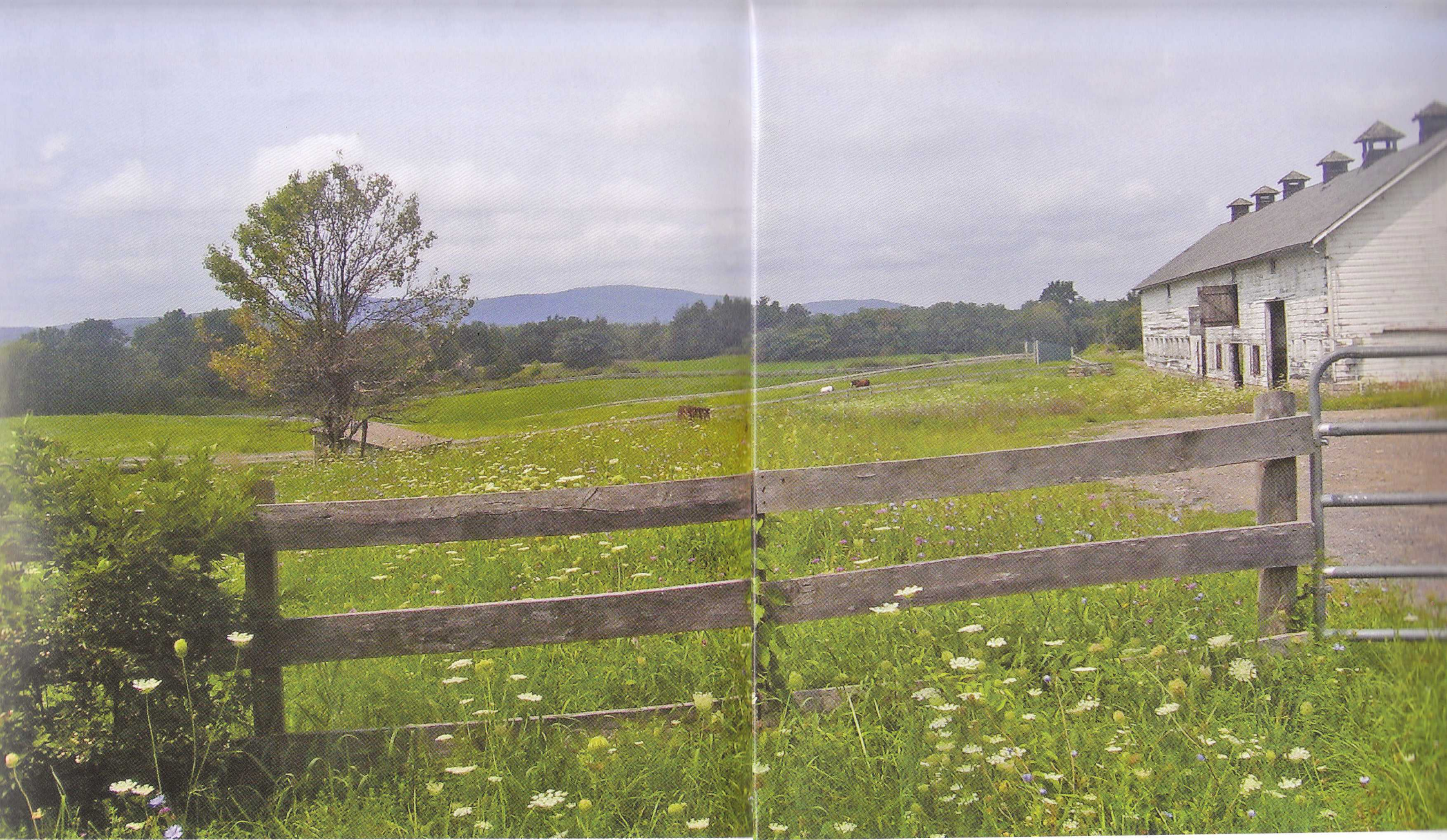
Fields in Rhinebeck, Dutchess Co., NY. Aug. 15, 2008.