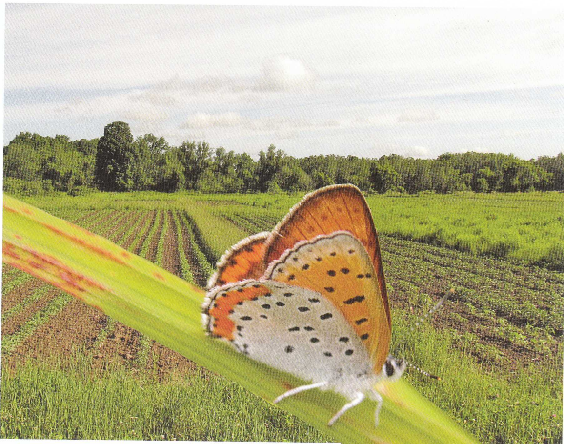
Bronze Copper Habitat: These permanent wild flower strips provided nectaring for abundant Bronze Coppers who apparently were flying in from adjacent wetlands. June 11, 2010. Chatham, Columbia County, NY.

dominant, accounting for around 15% of the county's land, while cultivated fields (mostly corn and soybean) probably don't reach 5%.