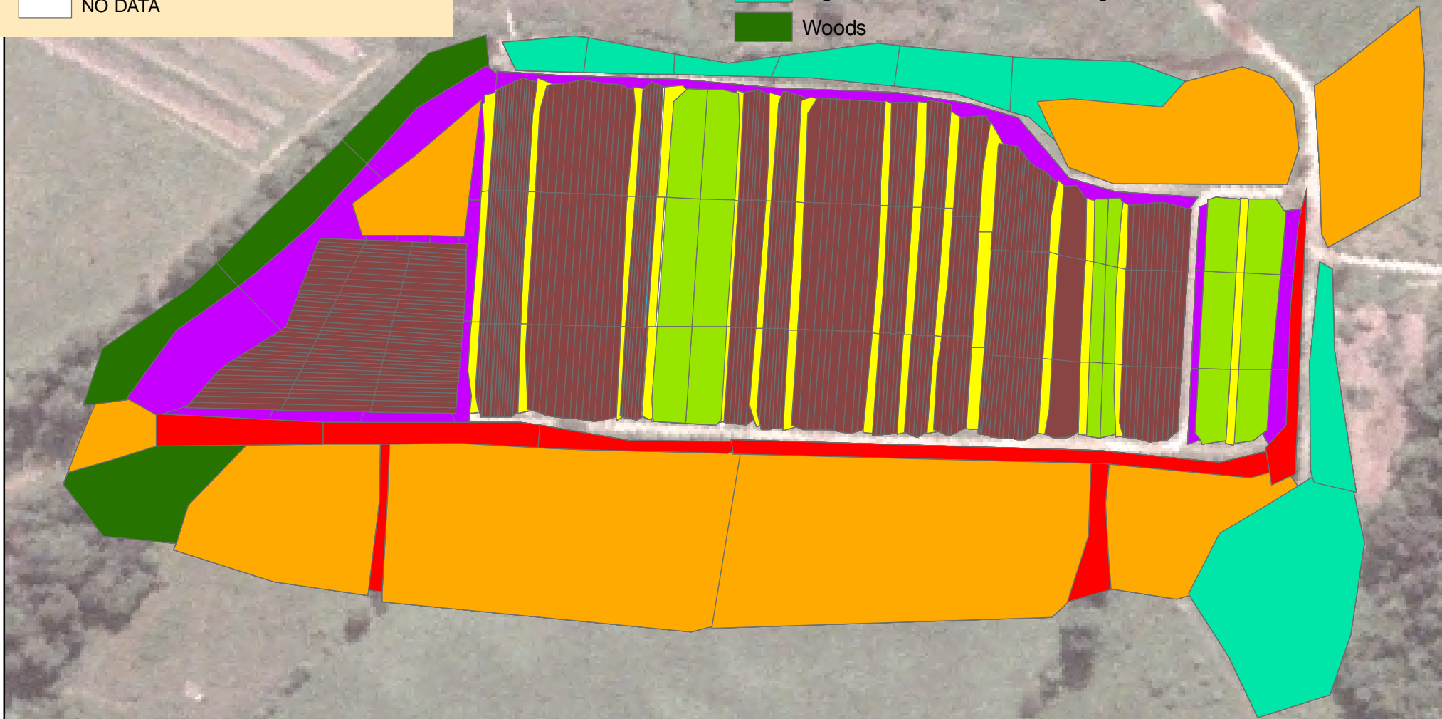
Occurrence of Aphids (Crop Inspections)